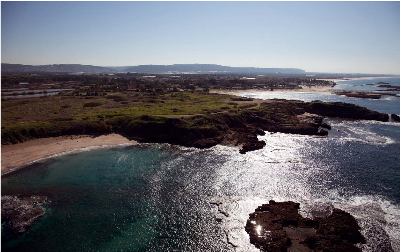
Fig. 4 South part of Tel Dor, looking southeast. On the south (right) is the southern lagoon with enclosing islets, its entrance marked by the fishing boats. In the background on the right the 'Carmel nose' is visible (9 km away).