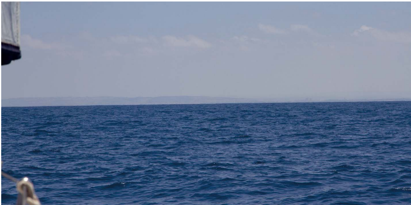
Fig. 5 The southern part of the Carmel range (background on left) as seen from 11 km at noon on a summer day with average visibility.

ing northwesterly winds in this part of the Mediterranean ( Mediterranean Pilot V , diagrams 1.151.1–1.54.4; somewhat less so in spring). Sailing through Dor (and/or through other anchorages in the southern Levant) would normally have been easier. One could set out from Egypt in the early morning with the local southerly breeze ( Mediterranean Pilot , 46, table 1.175) to a distance of about 3–5 nautical miles from the shore. 30 Then, once out in open sea, with the west wind one could reach Dor. Sailing from Egypt towards Dor in a northeastern course could have also been conducted with a northwest wind, but with difficulties due to the marginal angle of the apparent wind relative to the course. Sailing from Dor further north with this northwest wind, was, however, impossible. Leaving Dor could only be achieved at night/early morning with the local diurnal southeasterly breeze ( Mediterranean Pilot , 57, 58, e.g., table 1.186; MARCUS 1998, 95), and after a few hours one would take advantage of the local southwest or west winds (e.g., Mediterranean Pilot , e.g. table 1.186) to return to shore, to a more northerly anchorage (though at times one could also cast anchor a short distance from the coastline); and so forth until reaching the point(s) of destination in Lebanon.