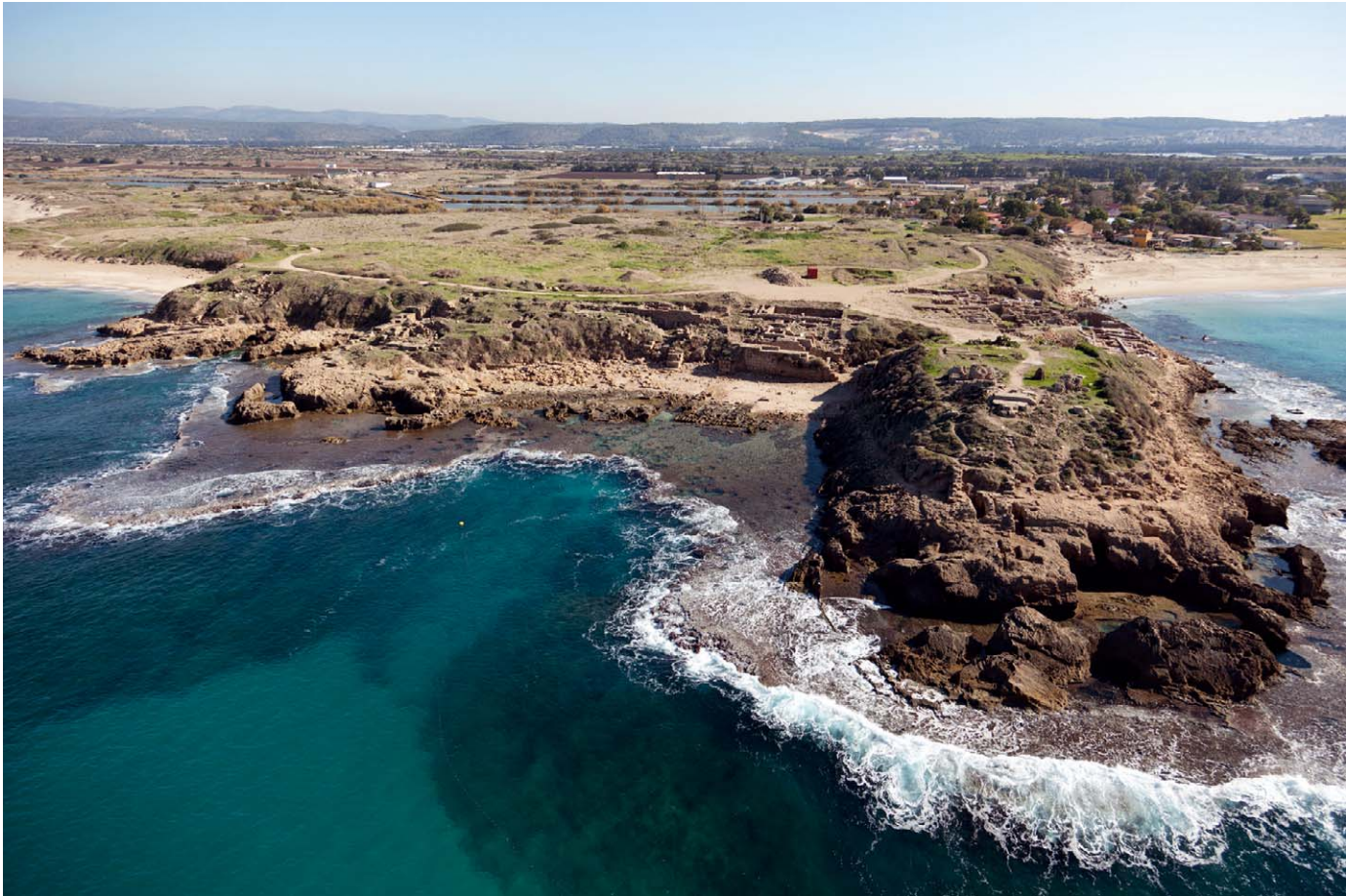
Fig. 3 Tel Dor, looking east. On the south (right) the northern tip of the southern lagoon is visible, with quays excavated by Raban (now submerged). In the background is the Carmel ridge.