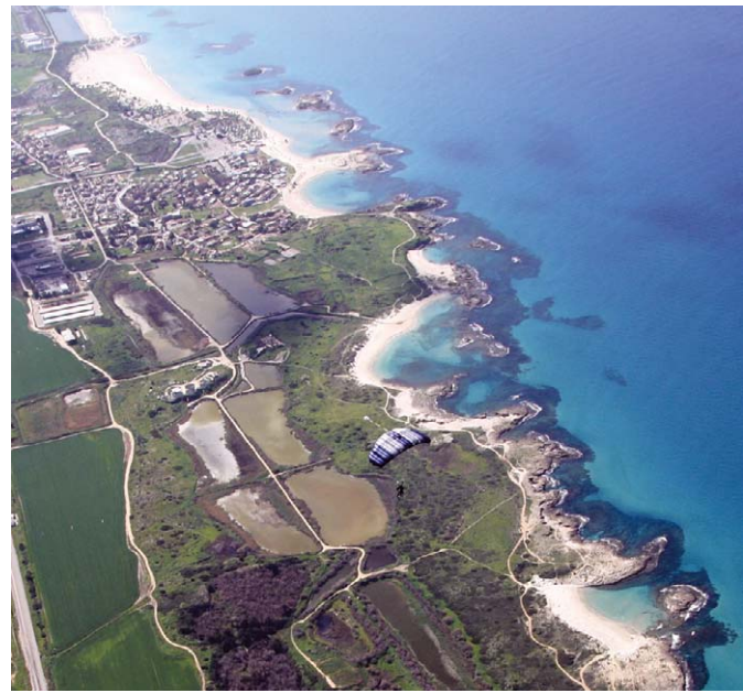
Fig. 2 Aerial view of the Carmel coast in Dor's vicinity, looking southwest. Above the parachutist are the northern bay, the tell and the southern lagoon protected by islets.

onstrate purple production at Dor at least from the early Iron Age. 1 As well, during this time span some of the site's inhabitants were engaged in another lucrative industry: small locally-produced clay flasks at Dor contained cinnamon from South Asia immersed in unidentified liquids. Such flasks (most probably also storing other flavoured substances) were distributed to various sites in the Levant, to Cyprus, and possibly to other regions as